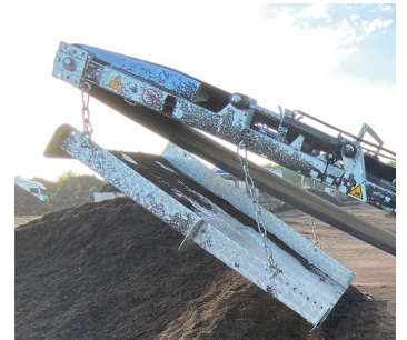
Magnetic Head Pulley