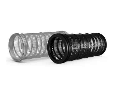
Different Screening Drums